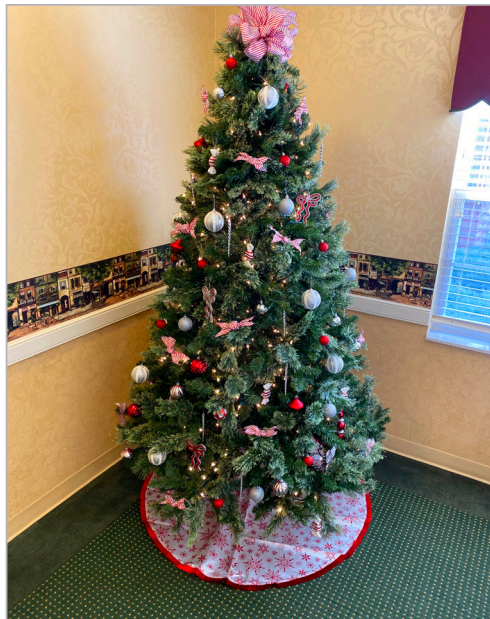
Finished Peppermint Tree