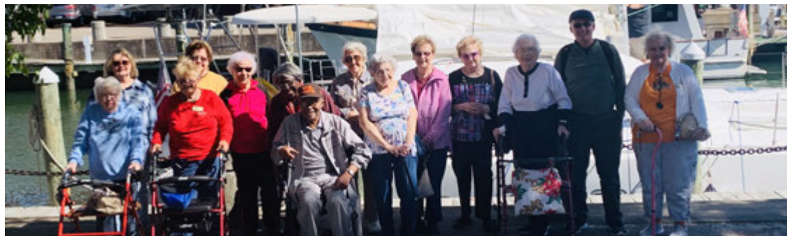
Group picture! Thanks for coming everybody, we had so much fun with you all!

It was a great day, low humidity and beautiful blue skies. The carousel ride was so much fun, we rode it twice! Afterwards, we sat outside at the Carousel Park and enjoyed a picnic lunch by the water.