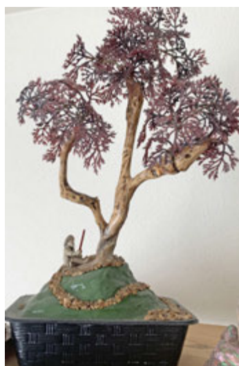
The first bonsai tree he made by hand