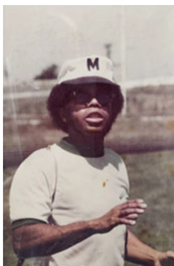
Flashback photo from his track coaching days