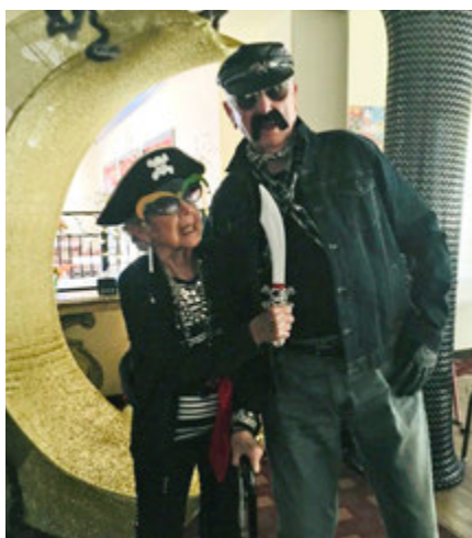
She's got him this time!