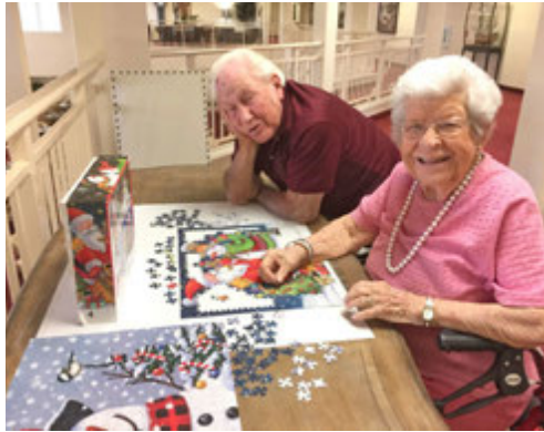
Christmas jigsaw puzzlers