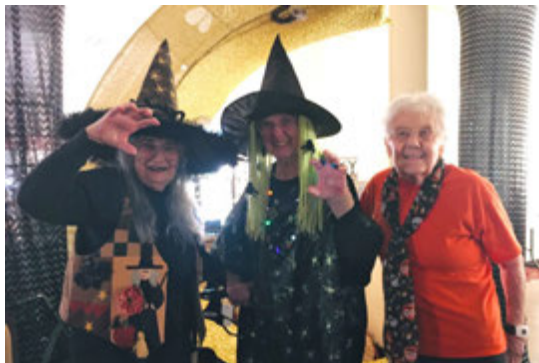
The witches among us!