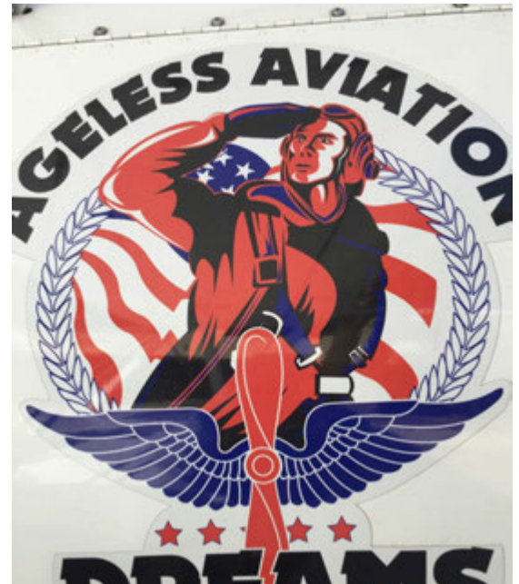
Ageless Aviation Emblem

The legs may have been a bit wobbly as they returned, but as our applause welcomed each of our wonderful aviators home, the broad smiles said it all. Regardless if this day was a reawakening of some glorious memories long forgotten, or if it signified a challenge bravely taken for the first time, it was without question, an experience that will never be forgotten.