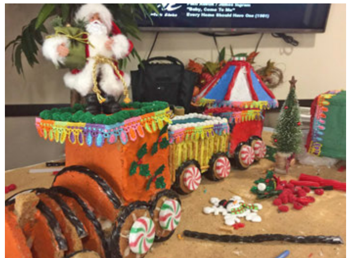
But look at her now!