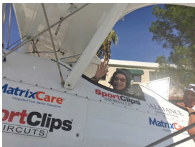
Aviator Dee Buckles