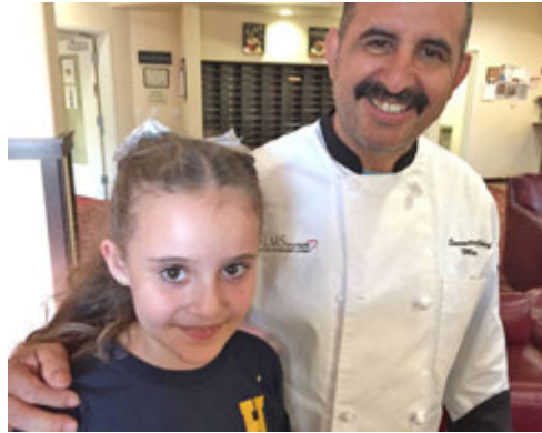
Chef and his beautiful daughter