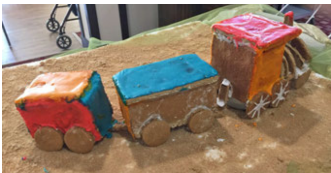
It started out slowly ...

Palmsters are doing a great job on our Gingerbread Train and it hasn't even pulled into the station yet, so stay tuned!