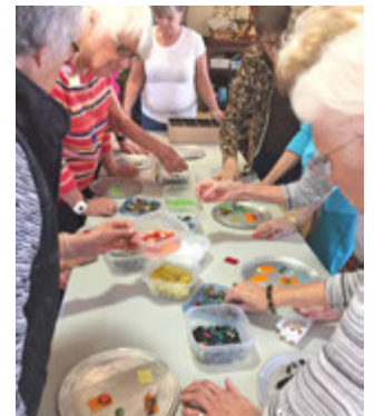
We just cannot get enough of this Craft Class!