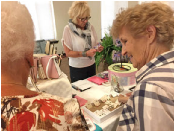
We shopped 'til we dropped!