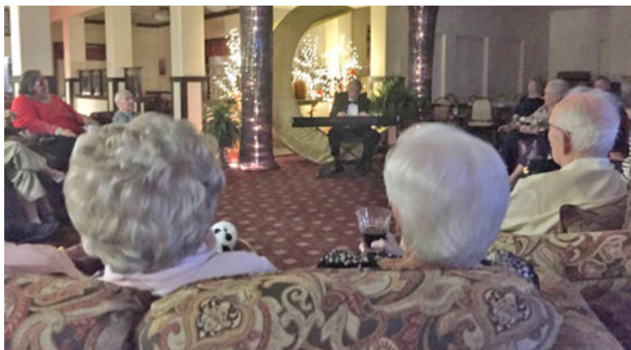
Snuggle Down Sunday audience