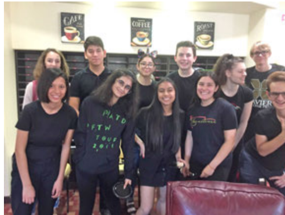
The Xavier Drama School play was terrific!