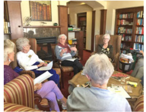
Our first Book Club Meeting was a hit!