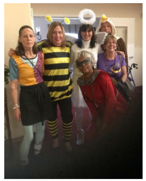
We all joined in the Halloween fun!