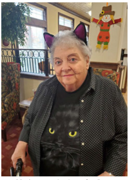
Marion was the "purr-fect" cat.