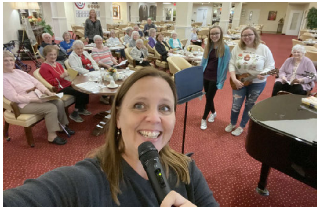
Highlands Tops take a selfie!