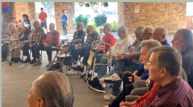
Veterans are honored during a special ceremony where each name was read and a rose was given to our heroes.