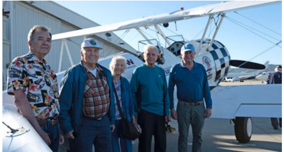
Getting ready to take off.