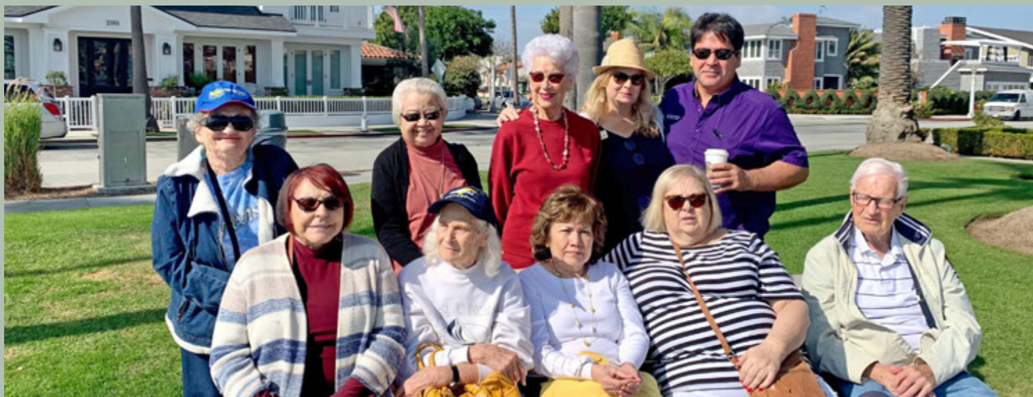
Newport Beach Harbor Cruise and Lunch.