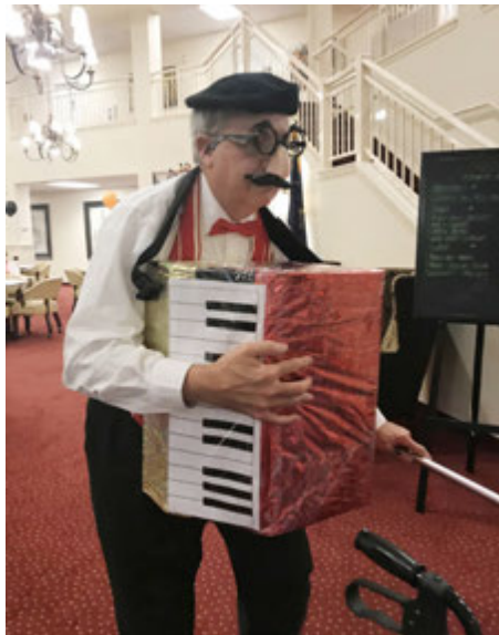
Second place winner