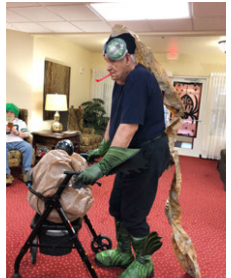
Third place winner