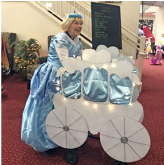
First place winner