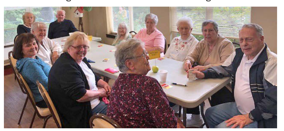
Heatherwood team The Swinging Seniors are up for the challenge.