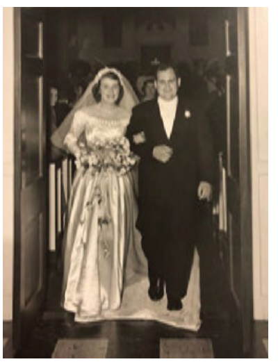
Mystery resident with her husband on their wedding day