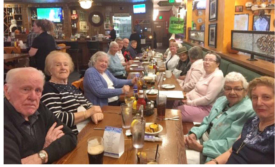
Hail, hail, the gang's all here!