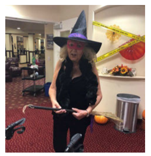
The good witch Loretta