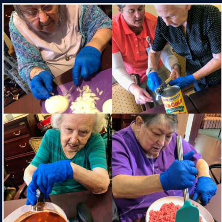
Cooking on colder days warms the heart!