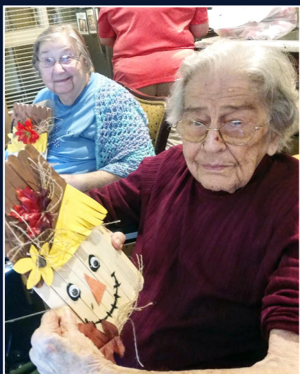
Residents make scarecrows and share laughs!