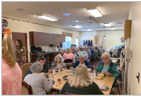
Rehab Reunion luncheon