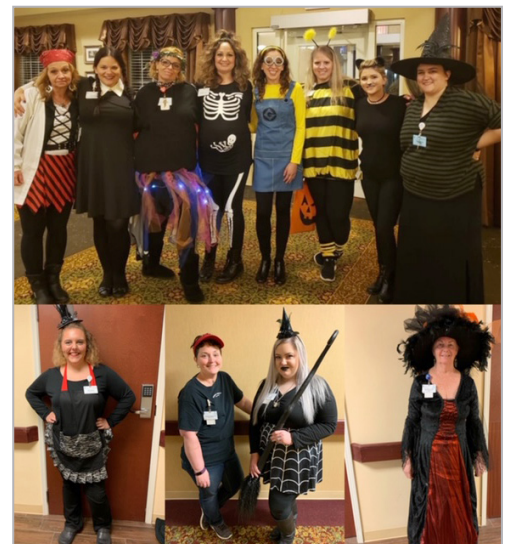
Staff dressed and ready for the Trick Or Treat Event!