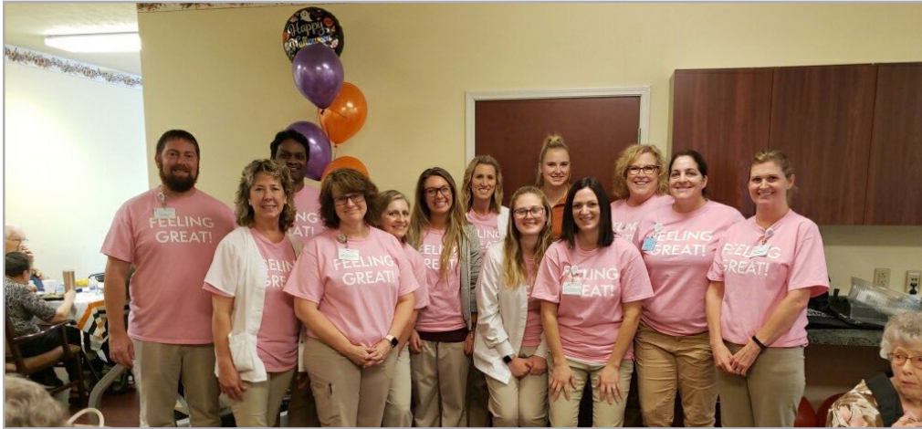
Paragon Rehabilitation Department

This past month we hosted our annual Rehabilitation Reunion and invited all of our “graduated” residents to come enjoy lunch, visit with one another, and celebrate their successes since being in our facility for rehabilitation.