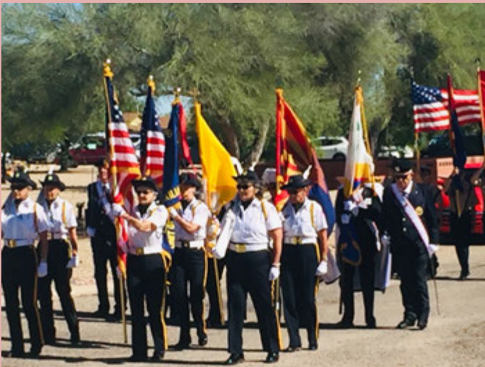
2018 American Legion Veterans Day Program

Again, thank you for your service to our country.