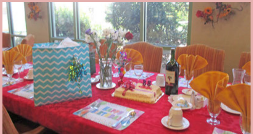
Friends made her day a very special one.