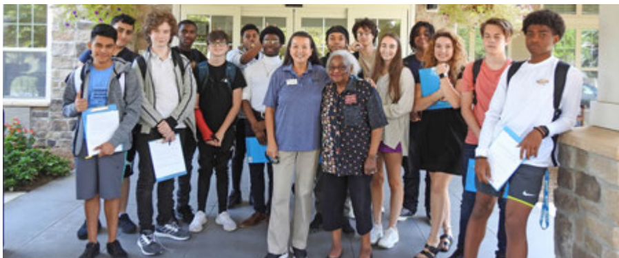
The Centennial High School Business class