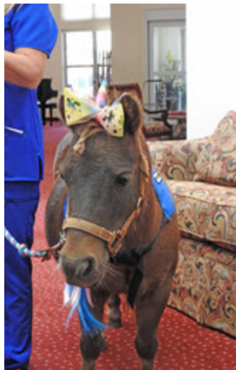
Scooter, the miniature horse

Who would think that a horse would walk inside to the Atrium at Sanford Estates! This adorable, well-behaved miniature horse named Scooter did just that. He came to visit us and brought along his friend, a beautiful Australian Shepherd. The two animals brought a smile to everyone's faces. We plan to visit the farm where Scooter and other miniature horses live.