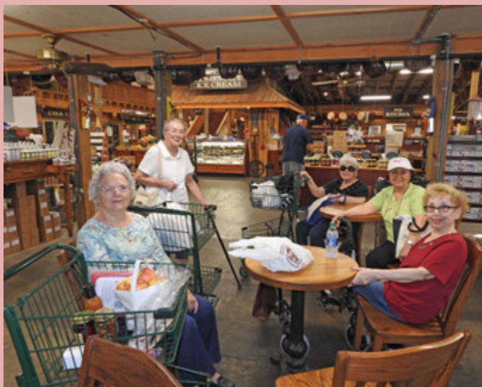
Residents with their purchases

We took a drive to the Panorama Farms Orchard Market in Ellijay, Georgia. Panorama Farms grows several varieties of apples and offers them at their market. You can sample each apple and choose the ones you like the most. But it doesn't just stop with apples. The store also offers pumpkins, gourds, homemade fudge and other candies, jams, jellies, pickles, honey, pies, cider, fresh produce, their famous fried pies, and much more. The bus was loaded with everyone's purchases. On the way back, we stopped at Cracker Barrel and enjoyed some delicious home cooking.