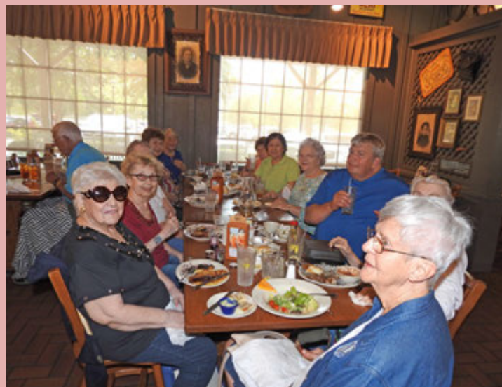
Enjoying lunch at Cracker Barrel