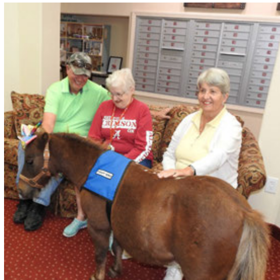
Scooter brought smiles to everyone!