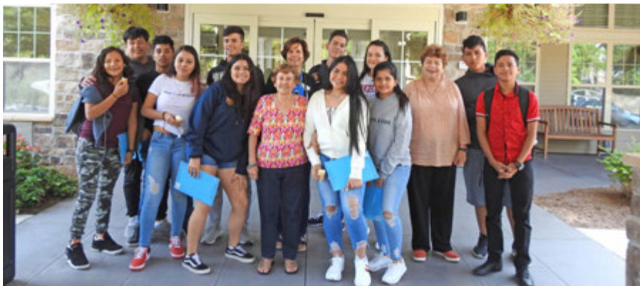
The Centennial High School Spanish class