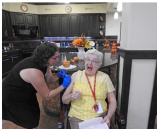
June has a different reaction!