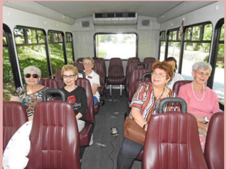
Residents enjoying the tour.