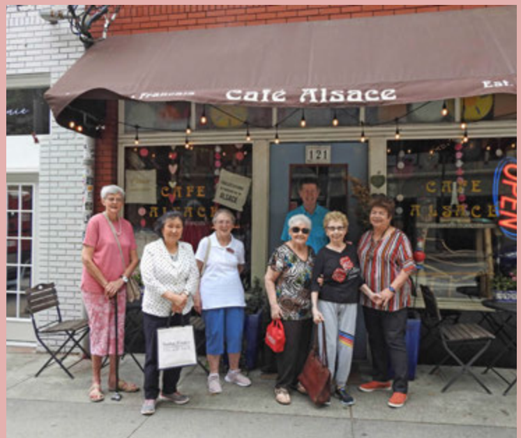
Lunch at a great French Cafe