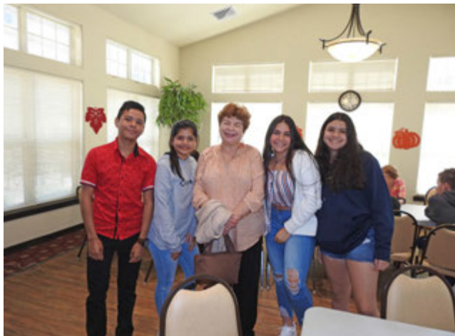
Rosa quickly developed a bond with some of the Hispanic students.