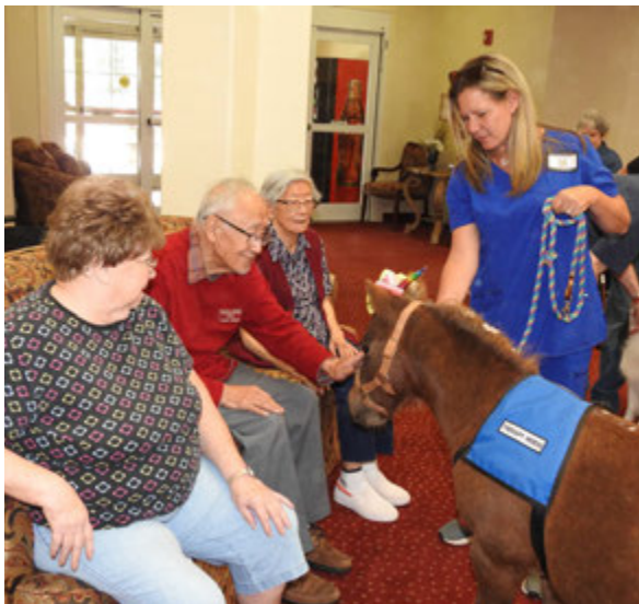
We all enjoyed petting Scooter.