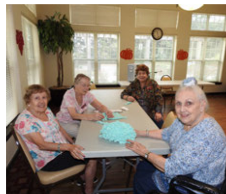
Learning how to use loop yarn

Our residents not only have a knit and crochet club, but now we have added two new yarn and fabric crafts. We are making old-fashioned brightly colored potholders on a loom. They make great Christmas presents. We also are learning how to use the new loop yarn. You can make a scarf or hat by pulling through loops with your fingers. No crochet hooks or knitting needles are required. If you would like to try one of these crafts, please join us on Friday at 10:30 a.m.