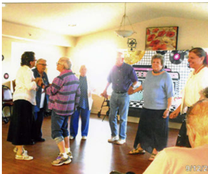
Time to fill the dance floor for a '50s Sock Hop