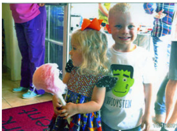
Walter's great-grandchildren enjoy some cotton candy.