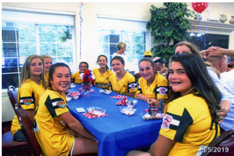
Rowan Girls Little League World Championship Team at Oak Park

They were not the only ones inviting them to their house to meet them and congratulate them. They had recently gotten an invitation from the President of the United States to come to the White House for a photo with him in the Oval Office.