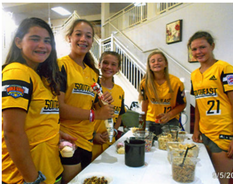
It is Banana Split time!

The entourage toured the U.S. Capitol, then went to the White House for a meet-and-greet and photo shoot with the President. A visit to the Supreme Court and Arlington National Cemetery was also planned.