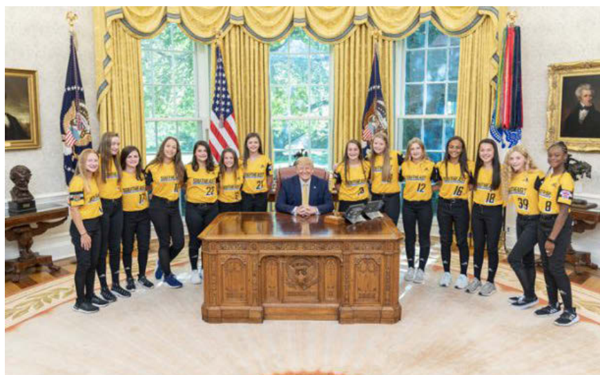
Members of the Rowan County Little League softball team meet with President Donald Trump in the Oval Office.