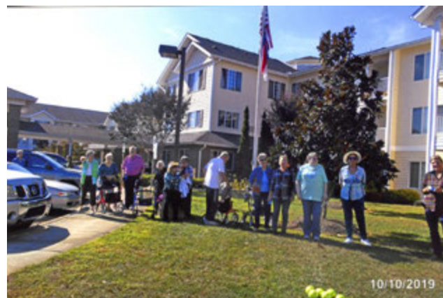
Residents line up to have a chance to dunk Chuck in the water.