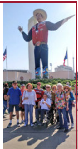
A beautiful day at the Fair!