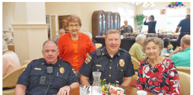
It's fun getting to know our first responders!