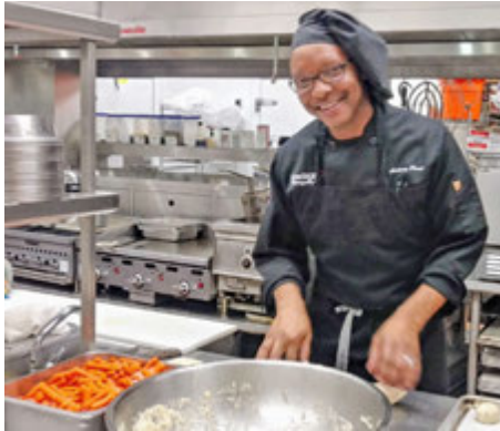
Working his magic!