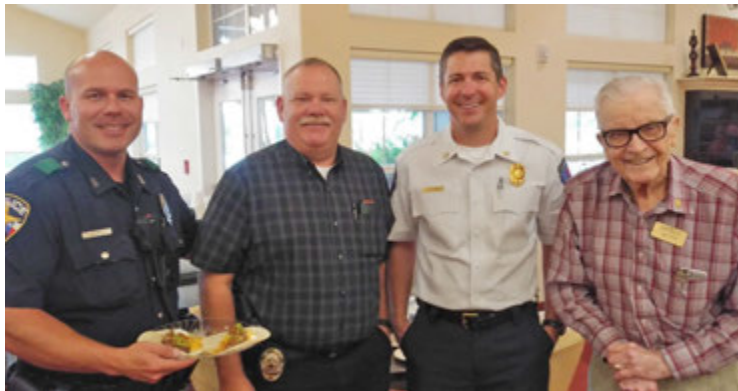
Good looking gentlemen!