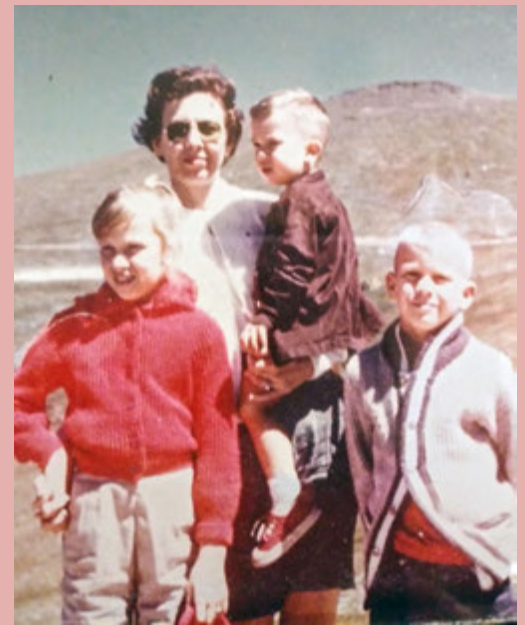
Family vacation in Colorado