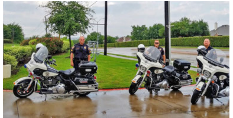
Check out those bikes!