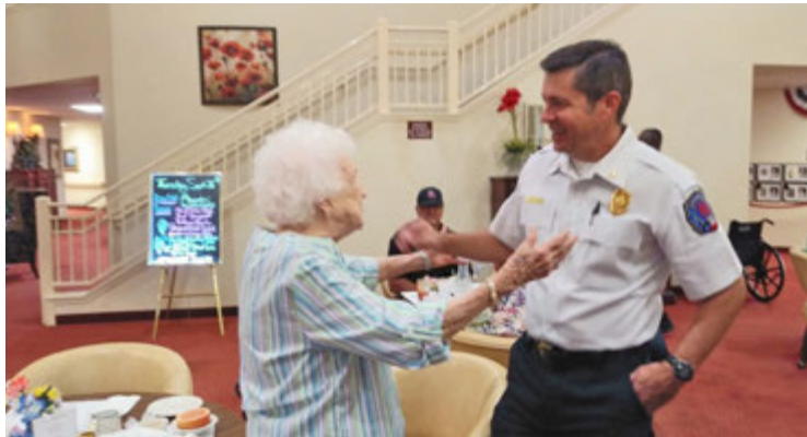
Billie meeting the Fire Chief!

We know their jobs are extremely difficult, and we are so grateful for each one who protects and serves our wonderful Rockwall community!