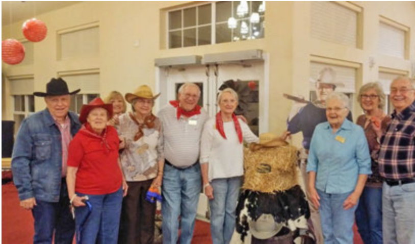
A special visit from John Wayne!