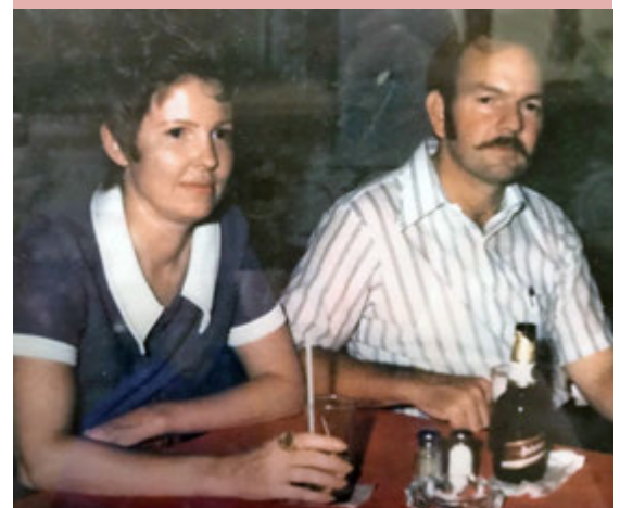
Who is this beautiful couple?

Who is this mystery couple? If you know who it is, stop by Julie's desk in the Activity Room for funny money!