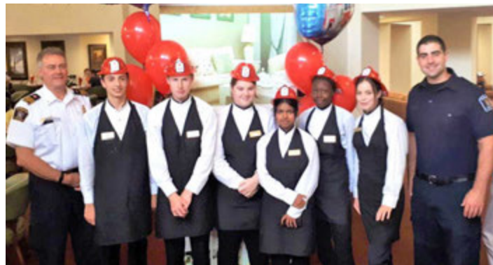
Our wonderful servers and chief/fire department