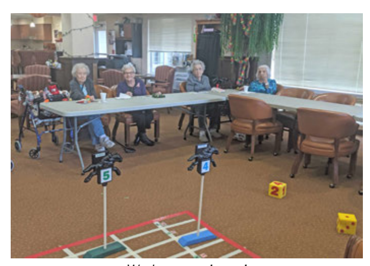
We have a winner!