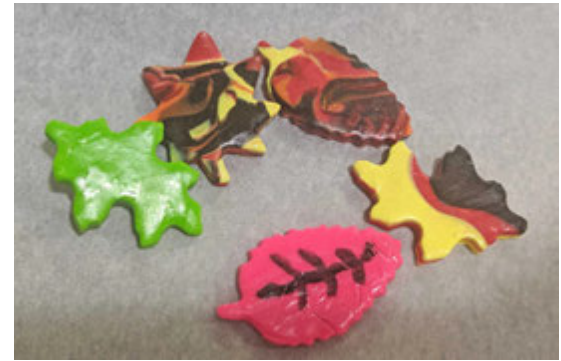
Mixing clay makes a marbled look.

press out shapes of pumpkins, leaves, bats, cats and more. Some people got really crafty and made designs by hand. Cut-out pieces were then baked in the oven for 15 minutes at 275 degrees. Once they were cooled, the pins were painted with a design, glazed and left to dry. A little bit of crazy glue with a pin on the back brought the whole thing together. Residents who made them were welcome to take what they made, but extras were made to be sold at Grandma's Attic.