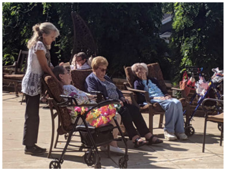
Mind over matter