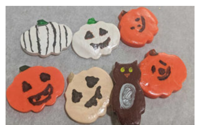
Painted and glazed by residents