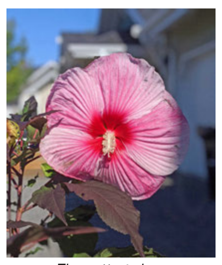
The cottage has beautiful flowers.