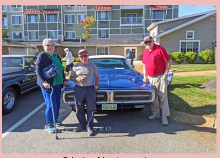
Bringing friends together