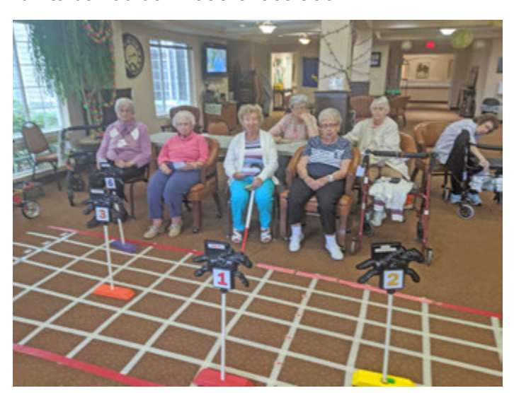
Ladies cheer on their horse.

Grab your quarters and your pom-poms, we're off to the horse races! Thursdays at 2:30 p.m. is horse racing at Colonial Gardens. Six games take place over the span of an hour. Residents only need one quarter per race, but can only bet up to five horses at once. There are a lot of laughs and smiles as people cheer on their horse. Some ladies stand up, clap and cheer. Others stay silent and tentative. Some people are superstitious about changing their numbers and others have their favorite numbers. The more people who attend, the bigger the pot! But if more than one person wins, the pot is divided evenly. There is a lot fun to be had down at the race track!