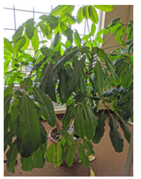
Umbrella Plant in Activities Room