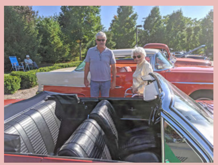
Family came to enjoy the cars.