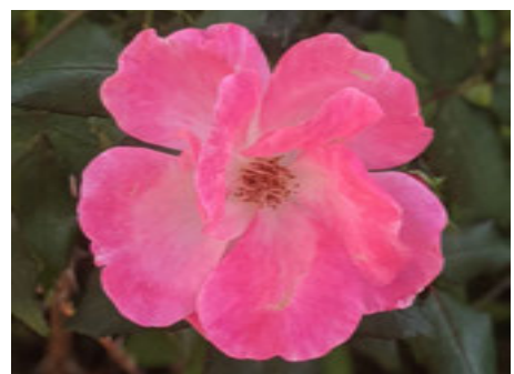
Flowers in our courtyard

Warm weather, plenty of rain, but also plenty of sun gave the perfect trifecta for flowers and plants around the grounds of Colonial Gardens. Some plants around the cottages were nibbled on by the wild rabbits during dusk and dawn. Our large umbrella plant is in the Activity Room. It was handed down from a resident who is no longer here, and Josephine takes care of it now.