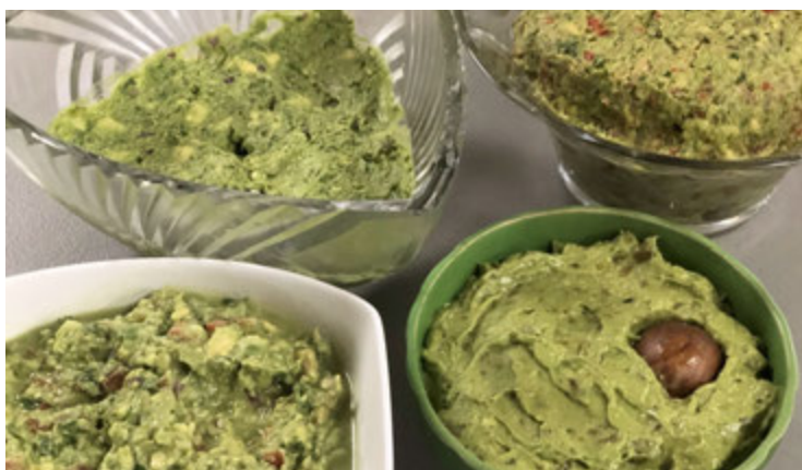
Some of the guacs!