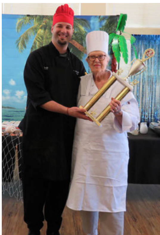
Our winning duo