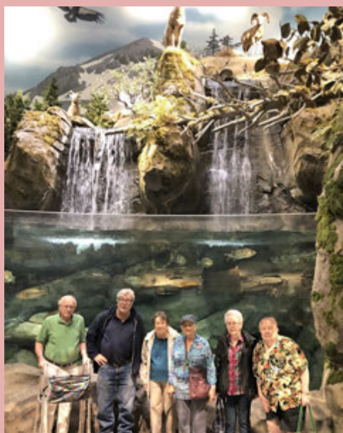
A wondrous place

For those of you who have never been to Bass Pro Shop, it is your one-stop shop for everything when it comes to camping, hunting, fishing and so on. The decor in the store is amazing with scenes of various wild animals placed around for effect. They also have a two-story high fish tank that has some rather large fish in them. When we were through shopping at Bass Pro Shop we had a wonderful lunch out to eat at Claim Jumper in Roseville.