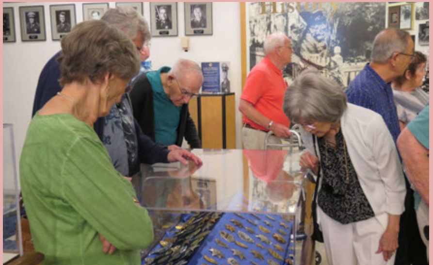
In the museum

We went on a wonderful tour of the California Highway Patrol Academy and Museum where we got to learn so much about the CHP that many of us had never known. In addition to preserving and protecting the history of the California Highway Patrol, the CHP Museum strives to educate visitors about the rich past of the CHP and how it evolved to meet the changing roadway systems in this country since the inception of the motor vehicle. They strive to honor those who have given their lives in service to the California Highway Patrol and the people of California and you can see and feel this when you visit the academy. The grounds were spectacularly kept and the lunch was delicious. After we were done eating, we got to watch a special ceremony called the Fountain Ceremony where cadets polished name plates of fallen active duty CHP Officers. It was marvelous to watch their precision when marching. All of the residents loved it and we would highly recommend it to others wanting to go.