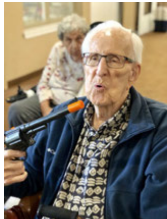
Cooling off the barrel