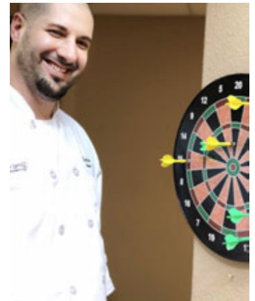
Dart board glory