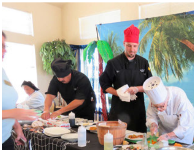
Some of the action!