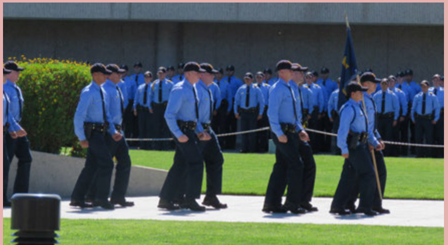
Cadets for Fountain Ceremony