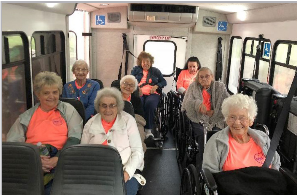
Getting ready to walk to end alzheimer's