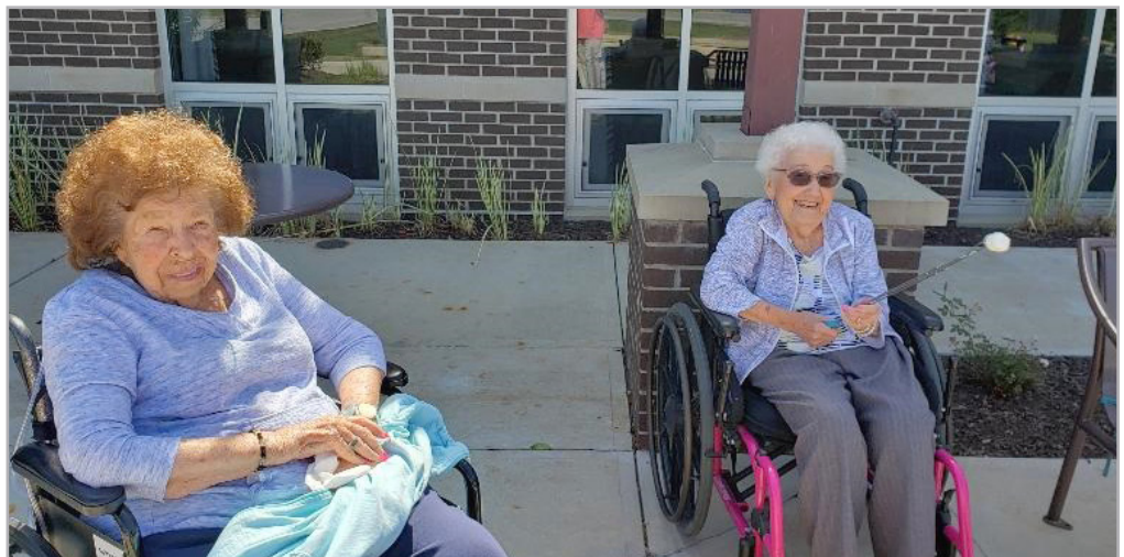
Enjoying the warm fall weather by the fire pit