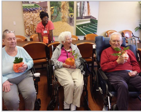
Fall pumpkin craft