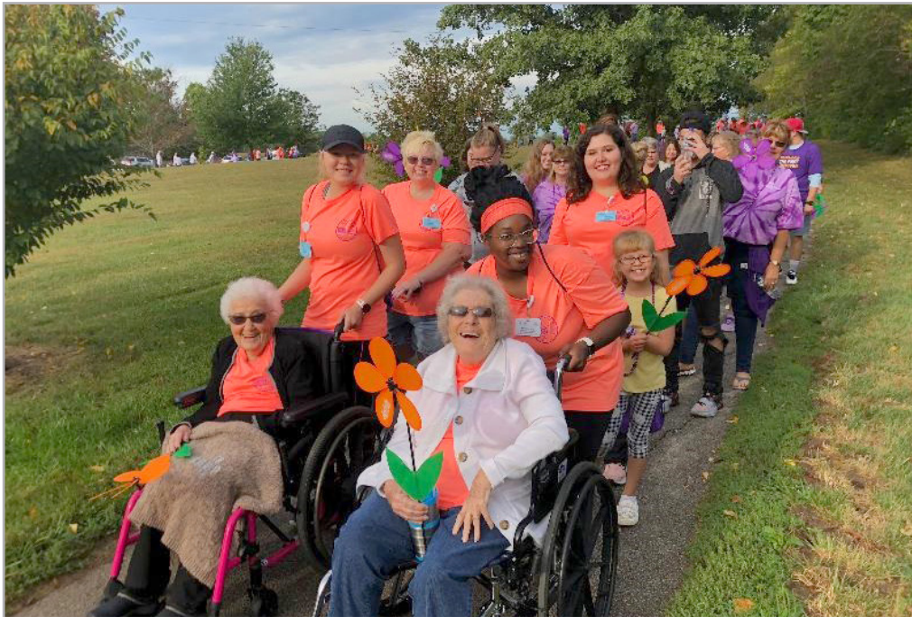
Enjoying our walk