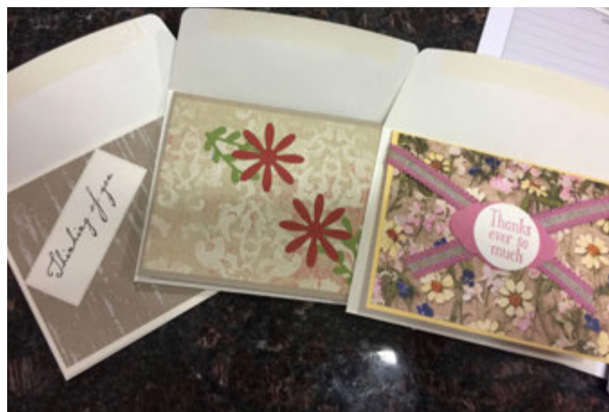
Assortment of greeting cards made with love