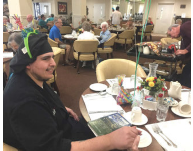
Thanks for sharing my birthday, ladies.