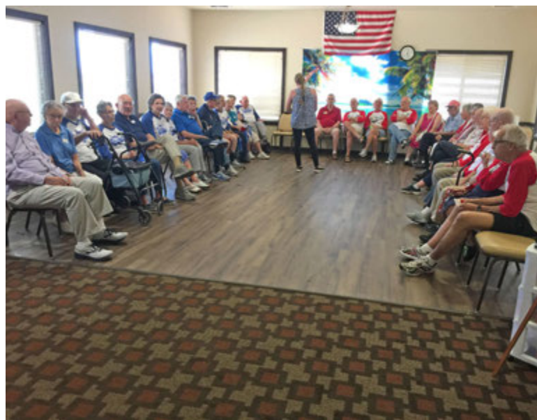
Paloma Landing and Rio Grande facing off for the Tournament.