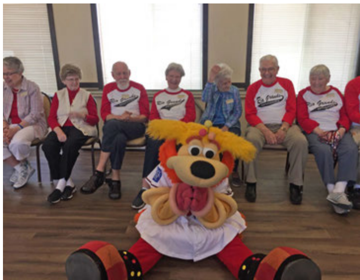
Orbit and the Rio Renegades

Thanks for the help, Orbit! It was a super time.