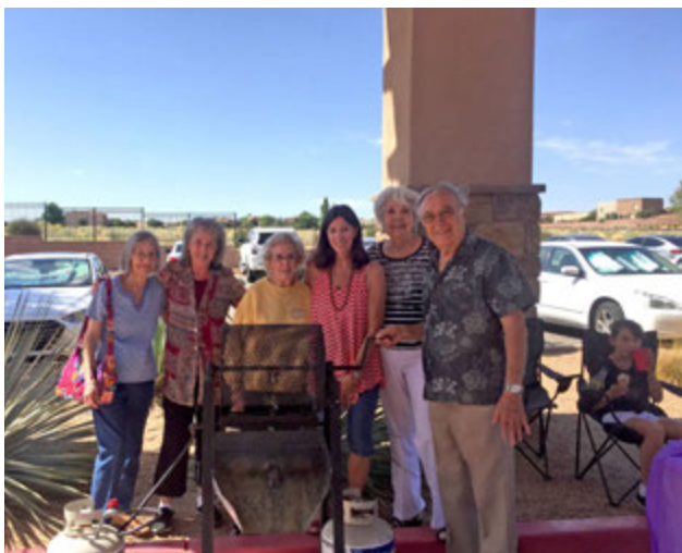
The smell is awesome.