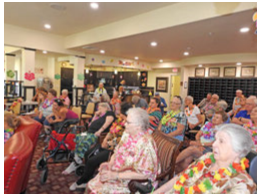
Great group for the entertainment