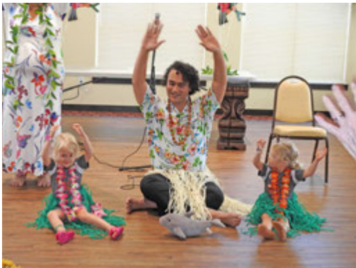
Teaching residents' grandchildren to hula