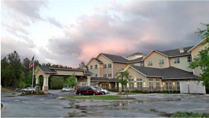
Early evening at Sanford Estates

Our building is located in the heart of busy Roswell, Georgia, but sits in a quiet area surrounded by trees. We see birds of all kinds, including blue birds, gold finches, song sparrows and hawks. This picture was taken in the evening after a rain shower.