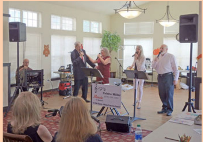
Singing group “Music to My Ears”