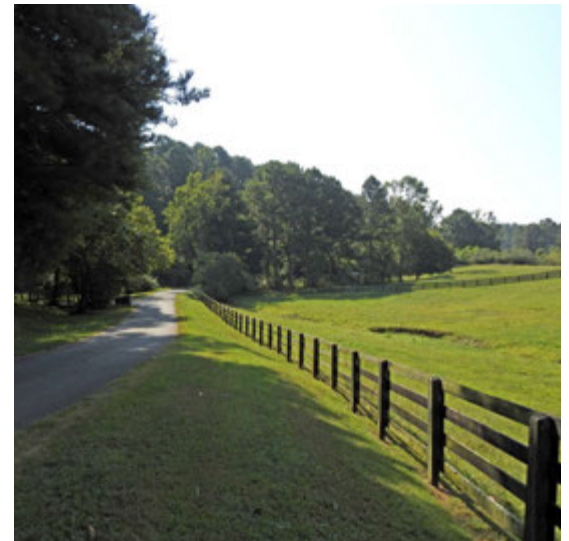
Beautiful green countryside!

This month has been so hot that we scheduled a scenic country drive for our residents. All they had to do was board the bus and be in air conditioning for a nice ride. We went down a couple of dirt roads (kudos to our new bus driver!) and saw some beautiful horse farms, including one farm that raises Arabians. It was a cool way to pass a hot summer morning!