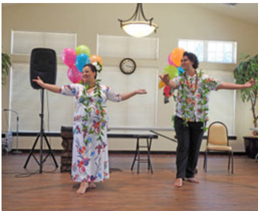
Dancing the hula