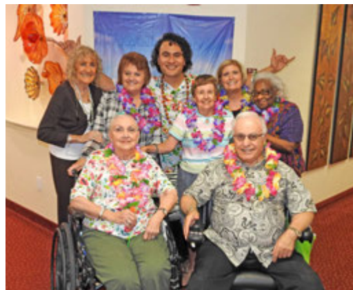
Group picture with Tupua