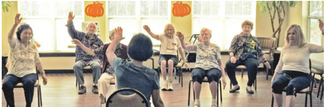
Tai Chi and Yoga Class