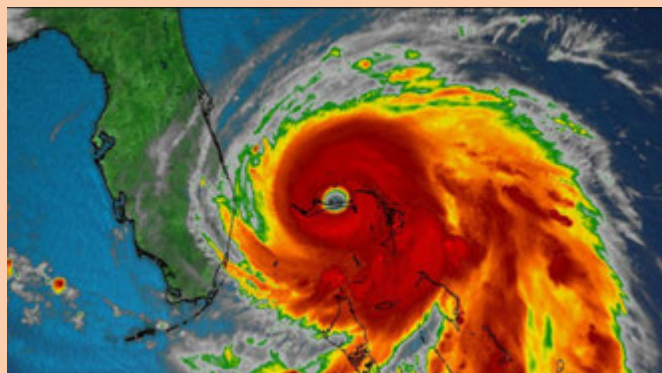
Turn north, Dorian!