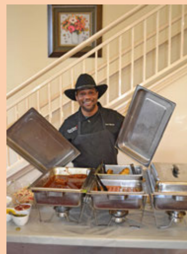
No leftovers today!