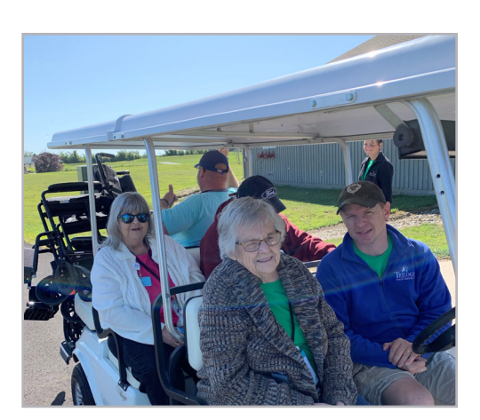
Golf Cart Ride