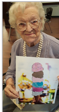
Photo Finish Craft