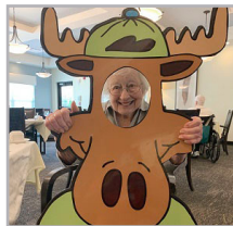
Taste of Town: Blue Moose