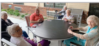
Playing euchre outside