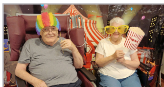
Happy Hour Fair