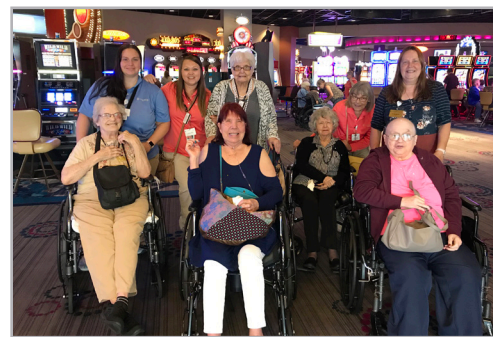
Our Grand Hoosier Casino group