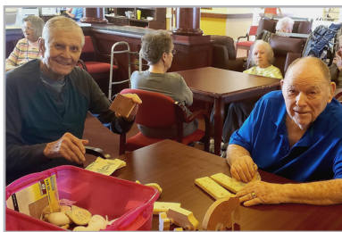
Some of the men sanding some wood so they can build