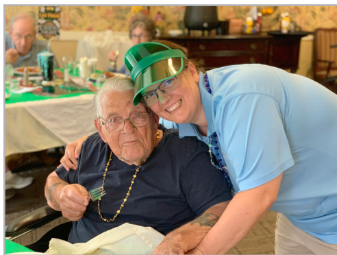
The Skee's ready for Casino Theme night!!