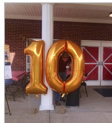
Woodmont Staff, Residents, and Family enjoyed a Family night hoe-down. Complete with Dancing, Music, a BBQ Dinner, and even Hayrides!!