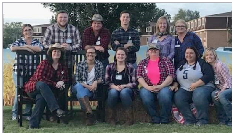
Woodmont Staff wants to Thank all the Residents and their Families that attended!