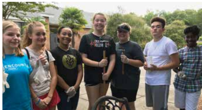
Middle Schoolers from the Harvest Church in Lexington are cleaning up our gardens and helping at the community.