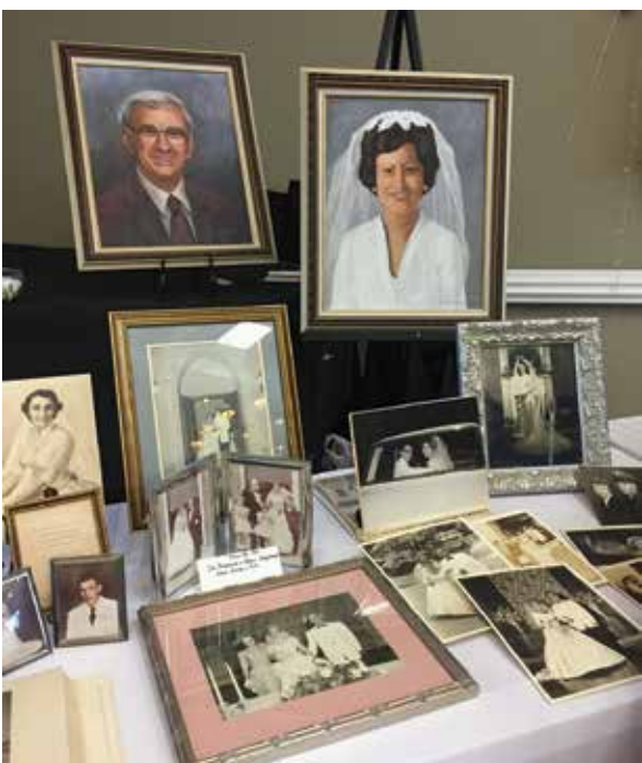
Wedding Month celebrations included wedding songs, a formal wedding cake and punch, plus a lovely photo display.