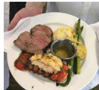
July's Pop-Up menu featured a delicious Surf and Turf entrée.

Residents can book in advance and select from a menu exactly what they would like to eat: appetizer, entrée and dessert. They also have a choice of wines to accompany the meal, if they like. The menu changes every month, and residents are asked to give menu suggestions for the upcoming event when they finish their meal.