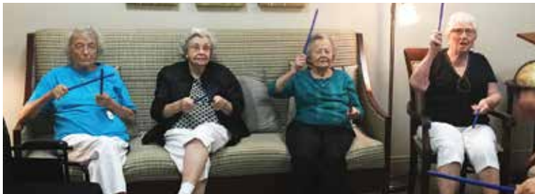
Florence residents enjoy the stimulation of a rhythm exercise using sticks.