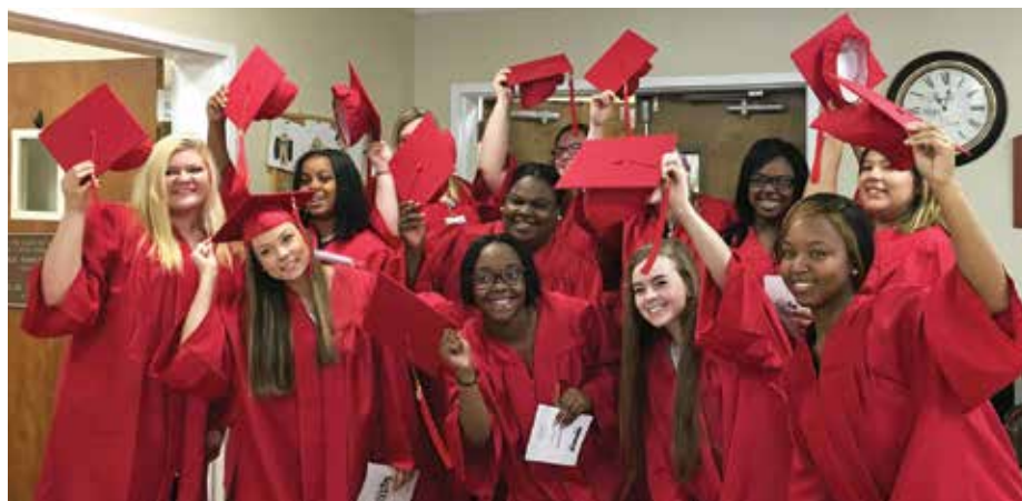
Left: Graduates of the CNA program celebrate their milestone.