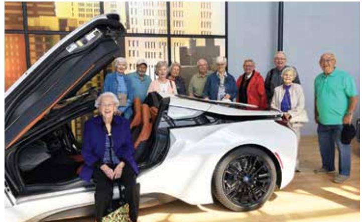
The trip to the BMW Zentrum Center was enjoyed by Clinton residents.