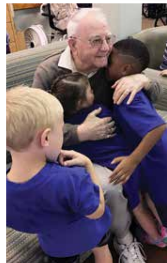
Love and Laughter Daycare visits always include a greeting of happy hugs at storytime.