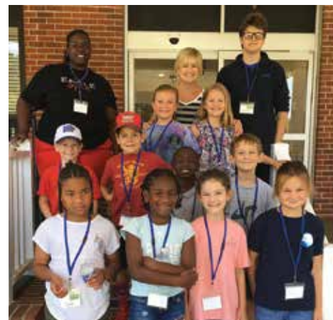
ServeFLO Campers visited the community as part of their summer mission work.

The Florence Community appreciates the ServeFLO Mission Camp kids for joining the residents for a wonderful time of love, service and friendship. Their assistance and interaction was enjoyed by all.