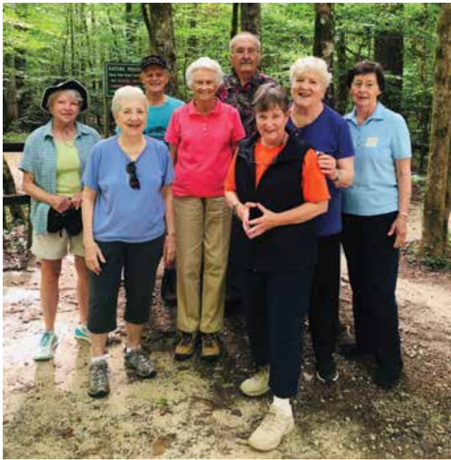
A group of residents are ready to hike Twin Falls.