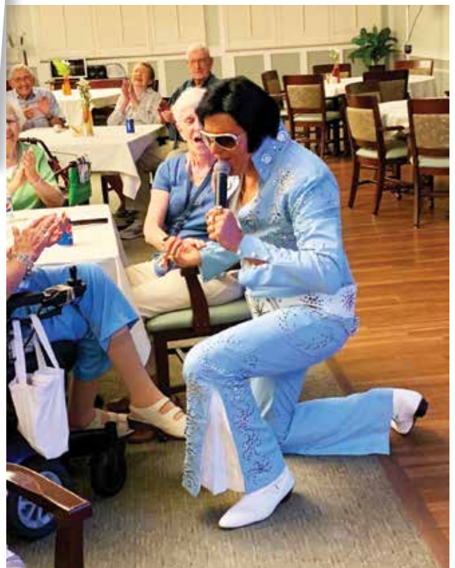
Elvis was in the building and our residents loved the performance!