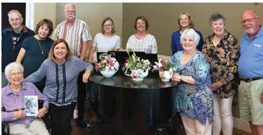
The Annual Mother's Day Tea is hosted by Seven Oaks Presbyterian's Hannah Circle.