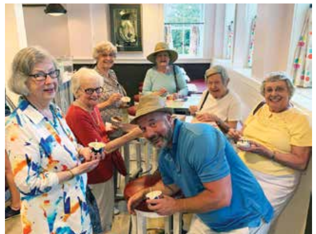
Village residents enjoy gelato at the Bearded Cat’s Sweet Shop.

The July trip was to the Obstinate Daughter on Sullivan’s Island, which is very popular with locals. The dinner was delicious and enjoyed by all. Afterwards, they went below the restaurant to “The Bearded Cat’s Sweet Shop,” and enjoyed gelato, which is the best way to polish off a delicious dinner during hot summer days. On the way home from dinner, the group was already plotting its next outing, and they decided next month they would check out an Italian restaurant located on Johns Island called Wild Olive.