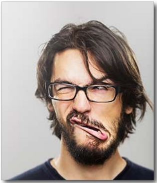
Gurning contests are older than soccer in England, dating back over 800 years.

On September 20, the Egremont Crab Fair will get underway on the West Cumbrian coast of England. This harvest festival was first held in 1267 when the Lord of the Barony of Egremont began the tradition of giving away crab apples to the village serfs. Today, the tradition continues with the Parade of the Apple Cart, where apples are thrown to crowds lining Main Street. Over the centuries, there have been many contests