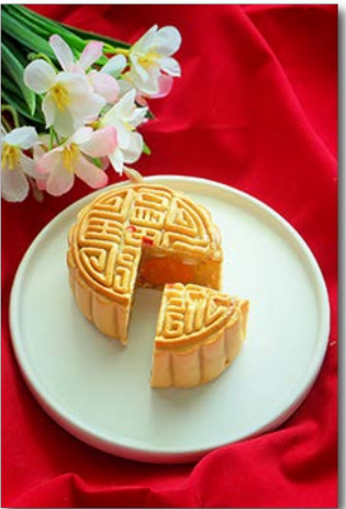
How mooncakes are presented as gifts is often more important than how they taste.

On the night of the full moon, families gather together for a merry feast. It is traditional to give, receive, and eat mooncakes, those dense, sweet pastries filled with red bean or lotus seed paste. Cakes are often imprinted with Chinese characters referencing the holiday and its legendary characters. Another common tradition is to light paper lanterns and release them into the night sky. It is also the perfect night to yearn for family and friends who live far away, much like Hou Yi’s pining for his beloved wife.