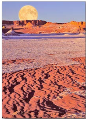
The Atacama Desert is the oldest desert in the world, experiencing arid conditions for the past 150 million years.

Humans have settled 77% of Earth’s surface, so what places are left unexplored? This September, Wilderness Month, we take a look at the world’s wildest places.