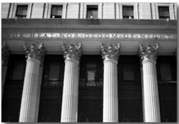
The unofficial motto of the U.S. Post Office was originally penned for couriers working around 500 BCE.

How much longer will such untouched corners of Earth exist? No one knows. But there is still ample time to visit and protect these pristine natural jewels.