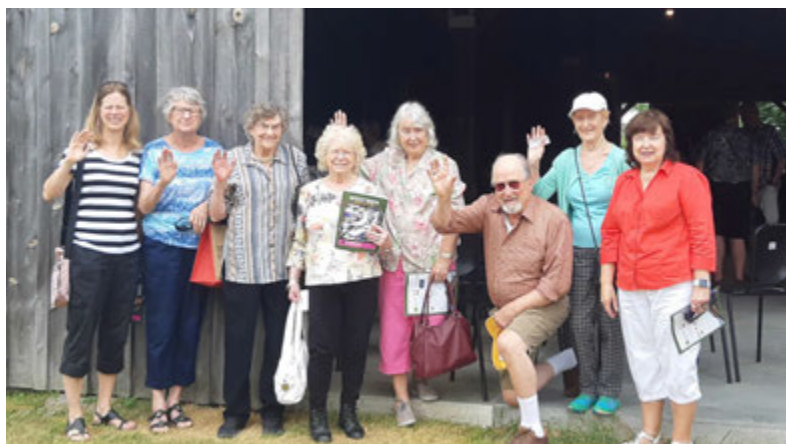
Getting ready to go in for the show!