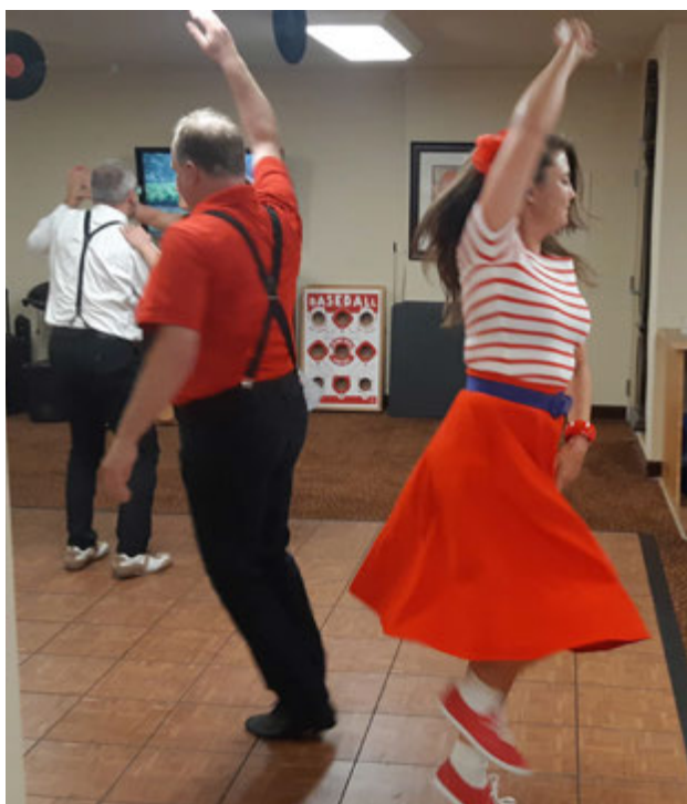
Two of the fantastic dancers showing us their moves