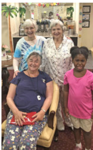
The girls in their PJs

Bottom line, we had a blast! Seeing everyone complimenting each other no matter what they were wearing was beautiful. It makes me realize the powerful impact a Community has on each and every single person who forms a part of it.