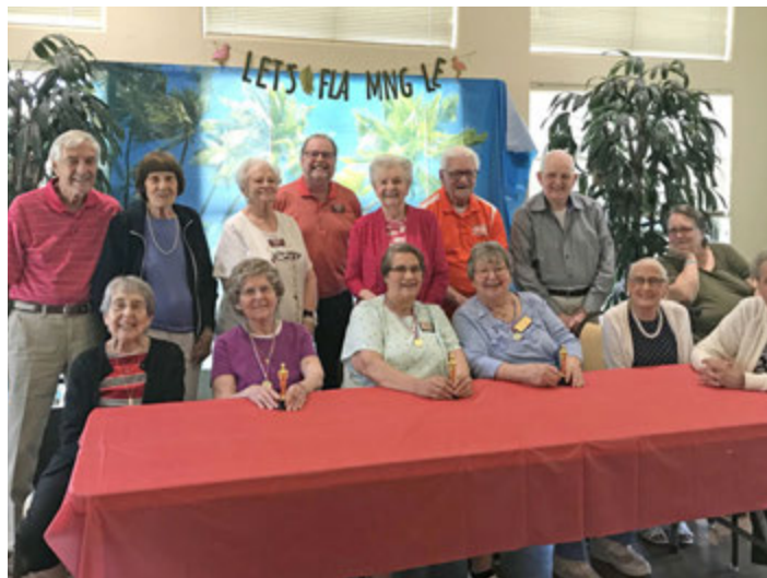
The full team!