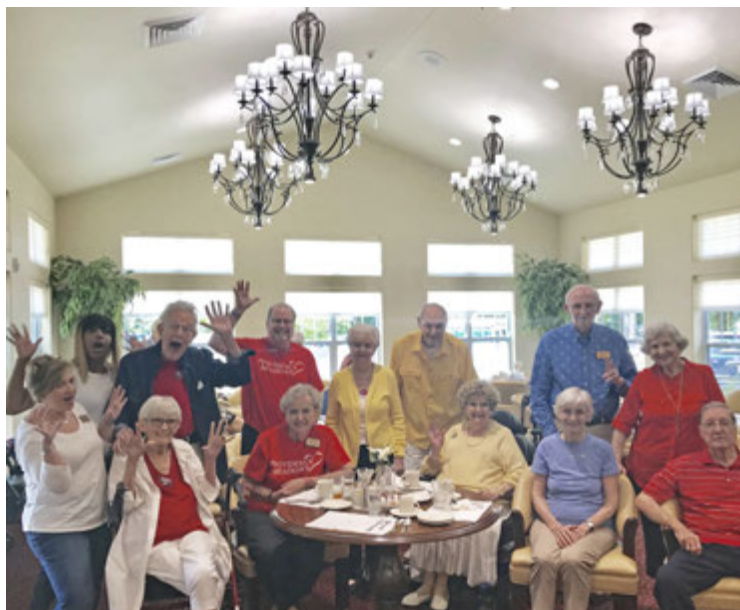
Wednesday: Twin Day!