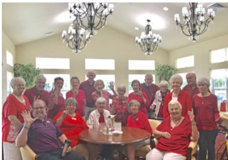
Monday: Red Shirt Day