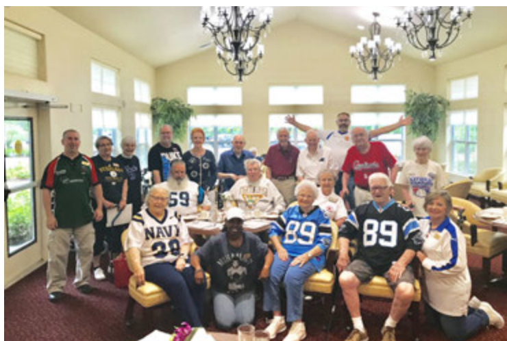
Tuesday: Favorite Team Shirt Day