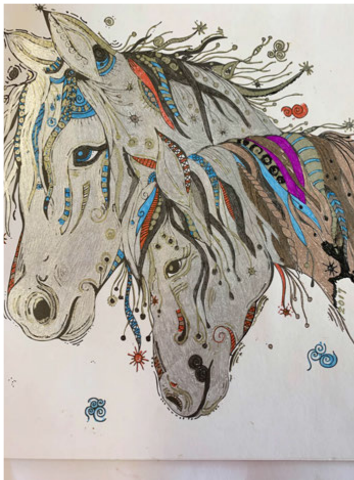
Who is the artist?