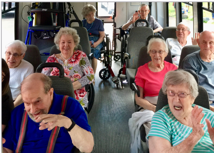
Residents on the bus excited to go to Ivanhoe's!