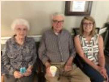
The English family enjoying Father's Day!