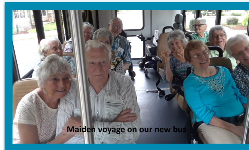
Maiden voyage on our new bus