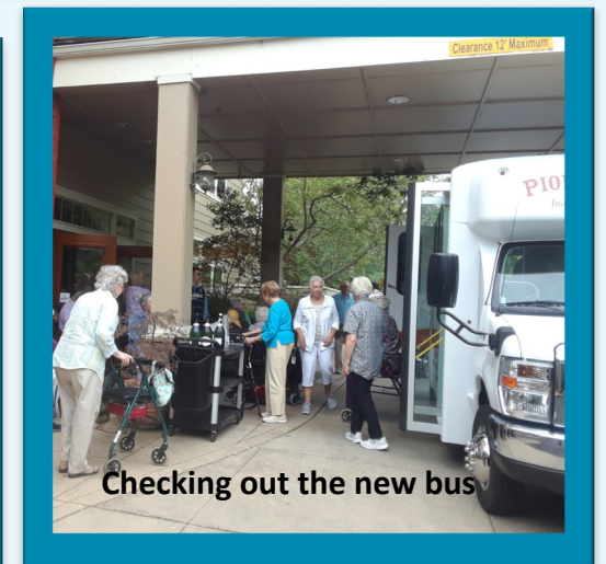
Checking out the new bus