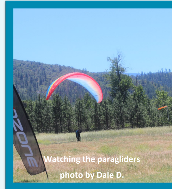
Watching the paragliders