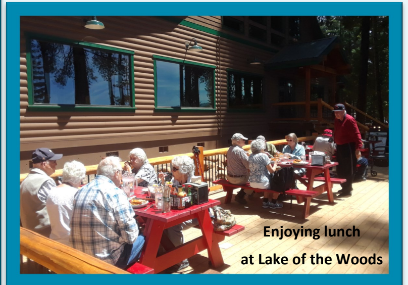
Enjoying lunch at Lake of the Woods