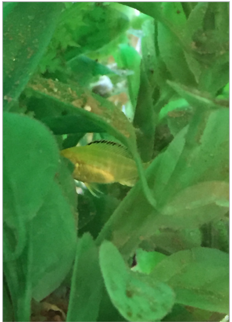
Here is a sneak peek at one of the babies!