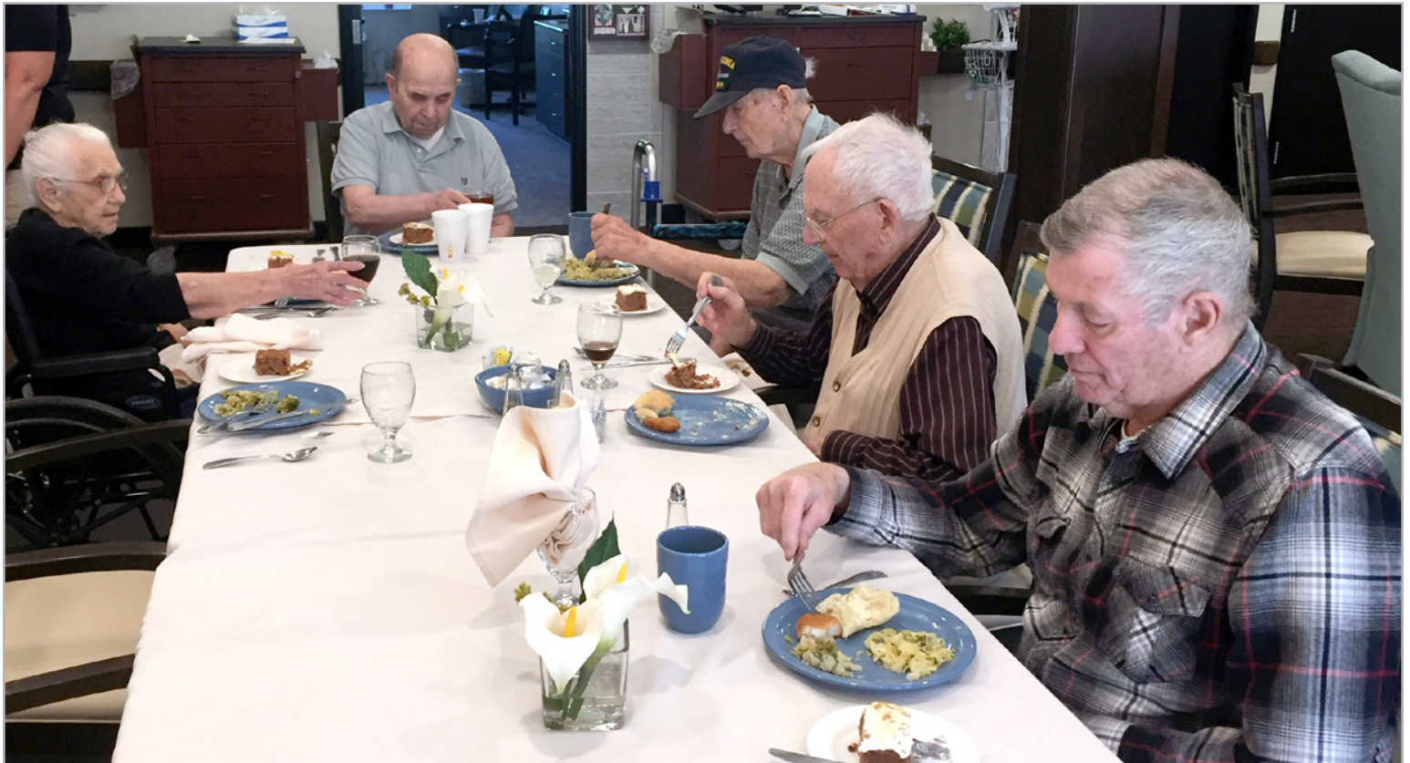
We enjoy eating our meals Homestyle. Come and join us for good conversation and delicious food.