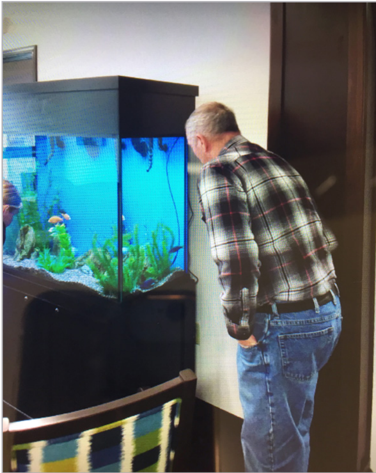
We have new life in our fish aquarium! Those little babies like to hide from us.