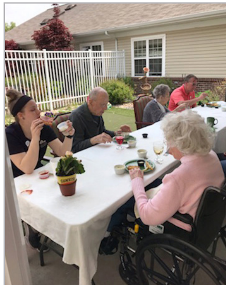
Lunch on the patio...Fun with friends...Priceless!