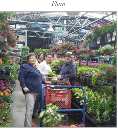
Our group flower shoppping at Lowe's