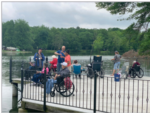
What a beautiful day for fishing!