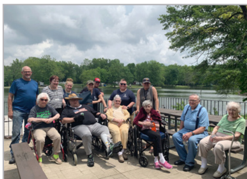
Another group picture of everyone!