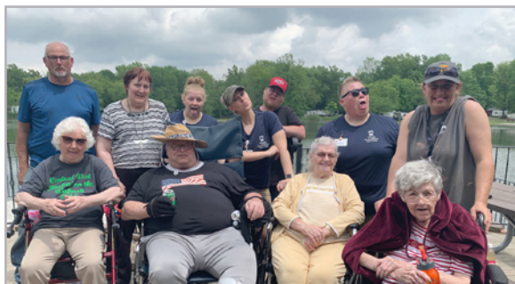
Our group of residents, staff, and volunteers!