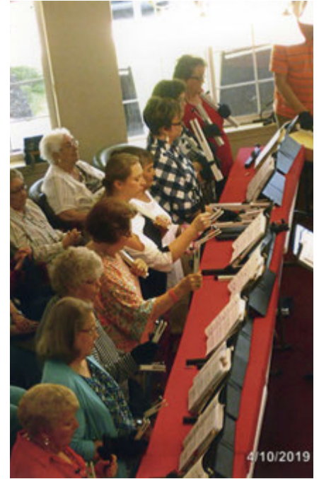
First Baptist Church of Mooresville performs for Oak Park.