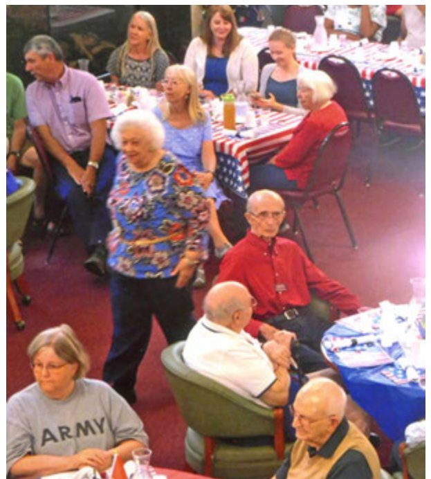
Dining room full of people enjoying the event on Memorial Day.