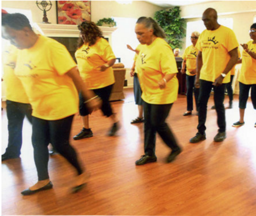
The Salisbury Dancers dance for the Oak Park residents.