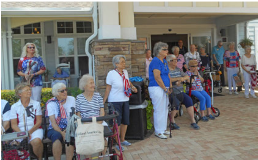
Some of our Memorial Day participants

This is one of those “just-in-case-you-forgot” items.