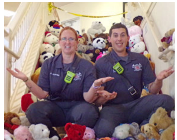
Two Fruitland Park First Responders and hundreds of teddy bears.