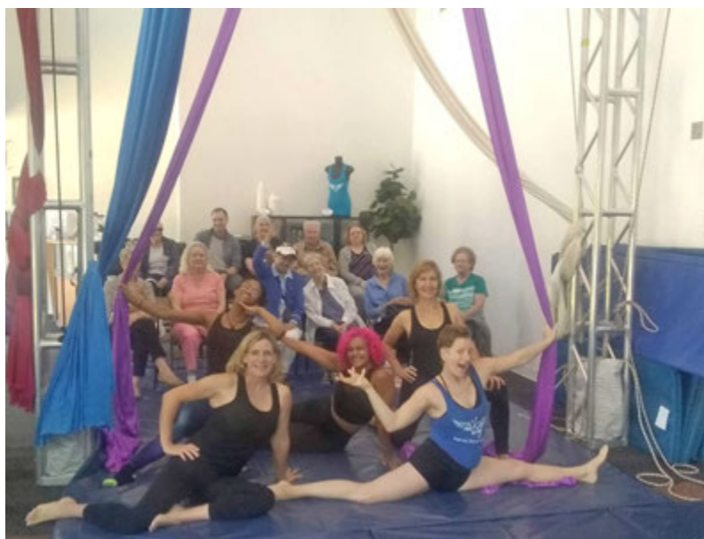
Cottonwood and Ashwood Meadows at the Sky Gym