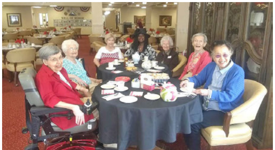
We greatly appreciate our ladies!