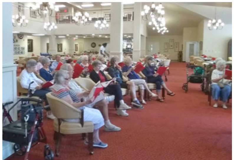
Residents at the singalong