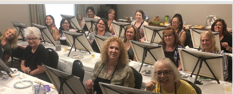
El Rio and The Park at Modesto staff.