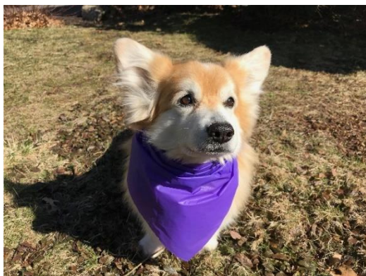
(From last years Purple Puppy Promenade)

For Artis' contribution, care partners as well as residents have made purple decorative bows for the parking meters downtown, and our fabulous Director of Culinary Services is baking organic dog biscuits for the "Purple Puppy Promenade." Please see the flyers in our lobby for ways to get involved. Please see the fliers in our lobby on how to get involved and come on down to the Depot Square on Sunday and see us!