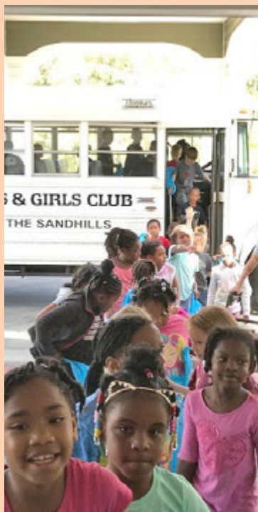
The Boys and Girls Club marched in for the hunt.

Excitement and laughter filled the air when 40 (yes, 40!) kids from the Boys and Girls Club came to find candy treats during our annual Easter Egg Hunt. This is a fun event for the kids and our residents alike!