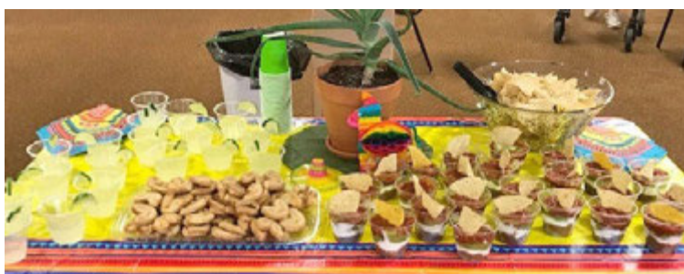
What a feast!