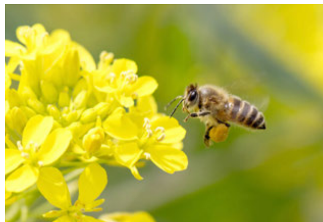
Bees have a sour sting but make sweet honey!