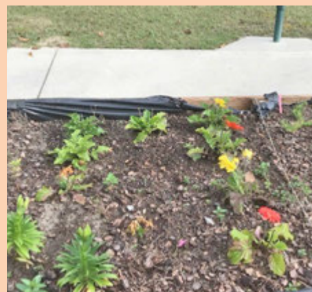
Rain and sunshine make our gardens grow!