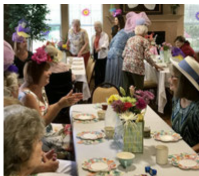
Everyone is having a grand time!