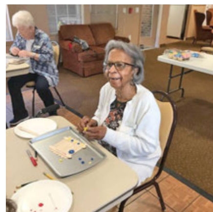
Dee decides on a blue and yellow color scheme.