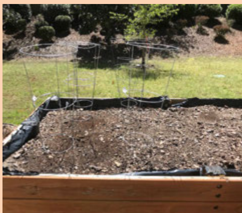
The weather is warm and the ground is ready!