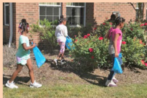
Looking for treats!