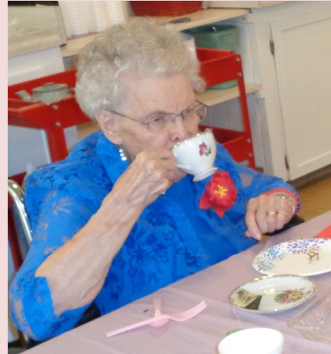
Virginia sips tea from a vintage tea cup. Each table was set with tea cups and saucers, various teas and a tea pot of hot water. Crackers with cheese and a sweet bite plus fresh grapes for our guests pleasure.