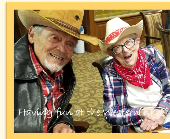
Having fun at the Western BBQ