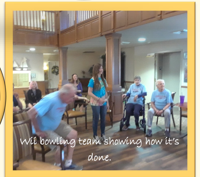
Wii bowling team showing how it's done.