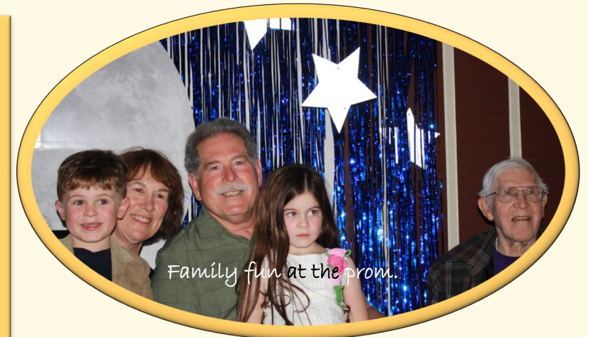
Family fun at the prom.