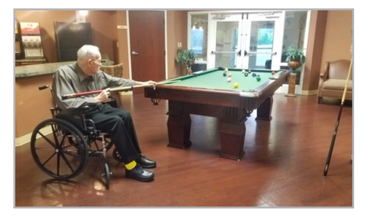
Residents enjoy playing pool with friends and family at West River!