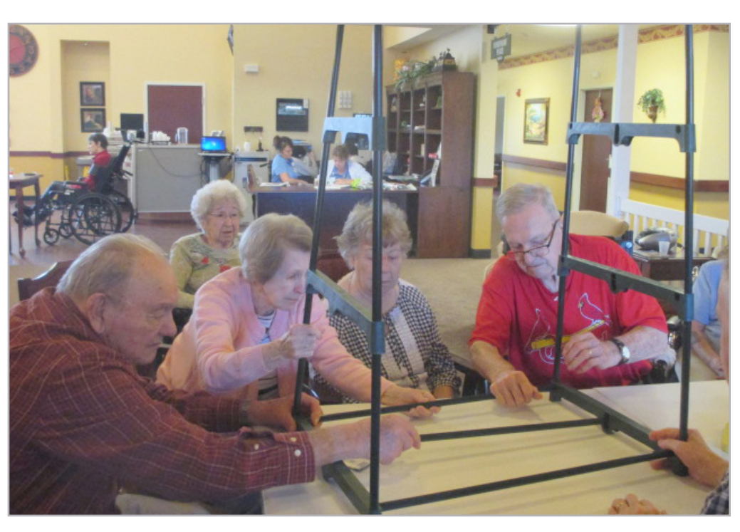
Legacy residents getting our greenhouse ready for seed planting.