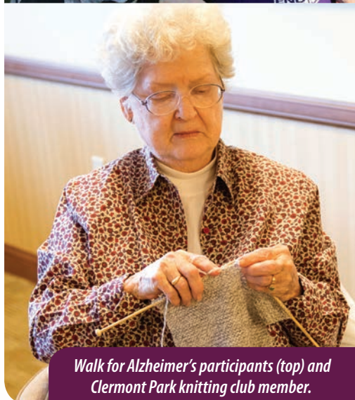
Walk for Alzheimer's participants (top) and Clermont Park knitting club member.