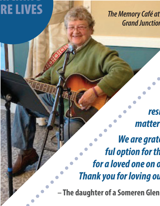
The Memory Café at Cappella Grand Junction

"We all know how frustrating it can be to work with those with memory loss. Our family is grateful for the way the staff treats each resident with compassion and dignity no matter how difficult a resident becomes."