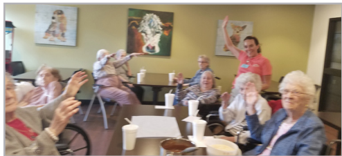
Raise your hand if you love chocolate – Creative Cooking