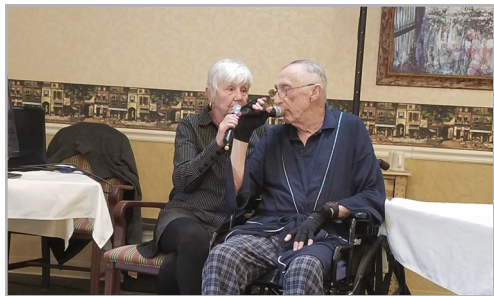
The McGlenns sang a beautiful duet.