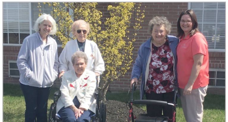
St. Andrews Walking group.