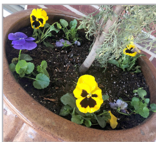
Thank you, Joy for starting off our Campus in Color with some beautiful flowers!

We can't thank our volunteers enough for all they do!