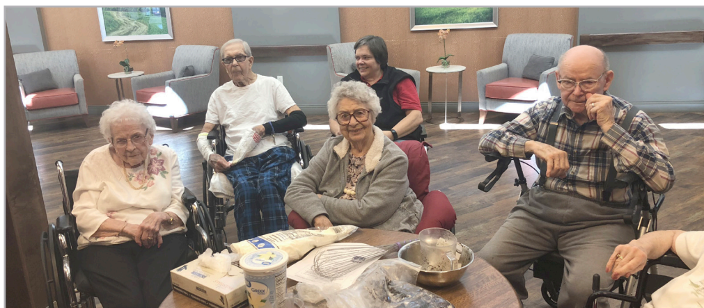
Group of residents at cooking club