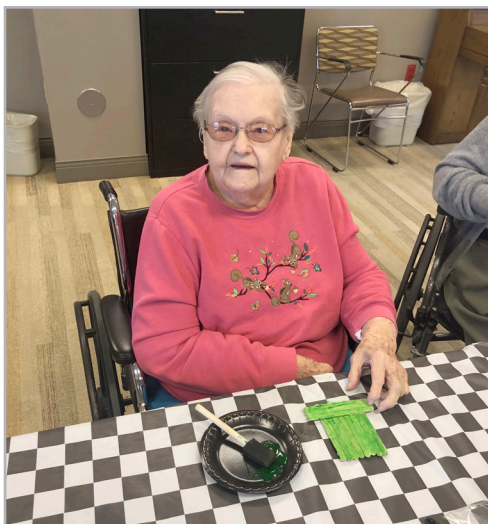
To Celebrate St. Patrick's day we made and painted leprechaun hats