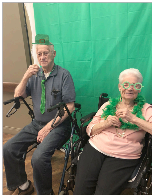
St. Patrick's Day Family night