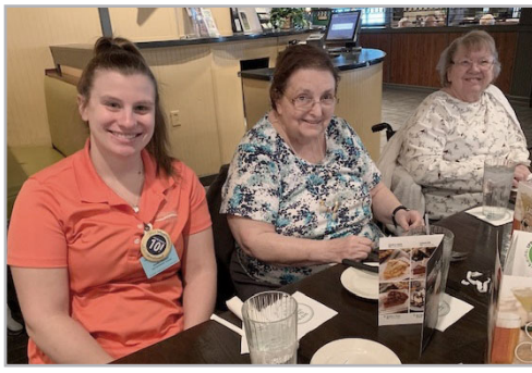
The Ladies Lunch Bunch strikes again! We had free pie on Wednesday at O'Charley's.